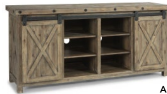
A. 7.25H 15.5W 16.25D B. 23.5H 15W 16.25D