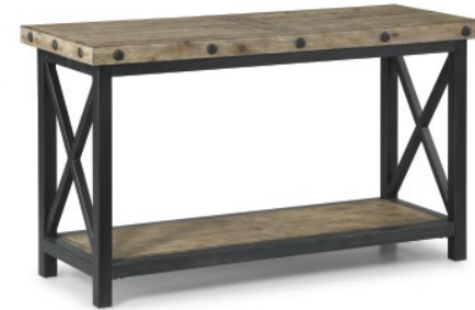
6723-04 Sofa Table 28H 49W 19D