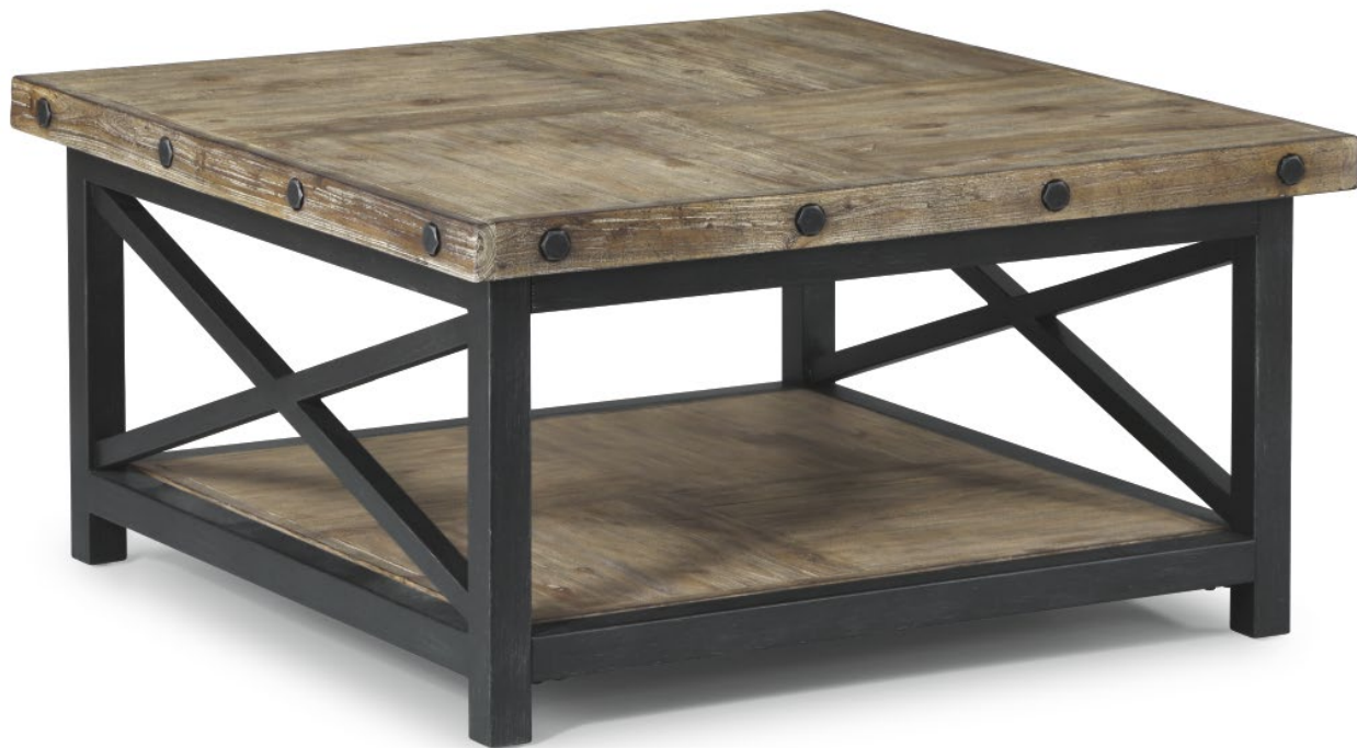
6723-032 Square Cocktail Table 18H 35W 35D