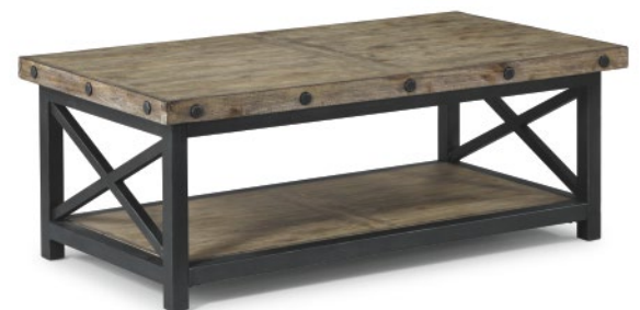
6723-031 Rectangular Cocktail Table 18H 49W 25D