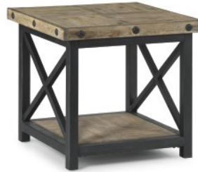
6723-02 Lamp Table 23H 25W 25D