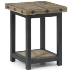
6723-07 Chairside Table 23H 18W 18D