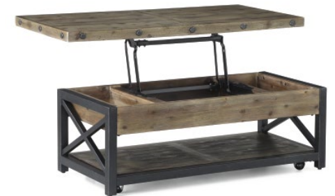
6723-0311 Rectangular Lift-Top Cocktail Table with Casters 18H 50W 26D