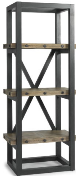
6723-069 Side Pier 68H 28W 18D