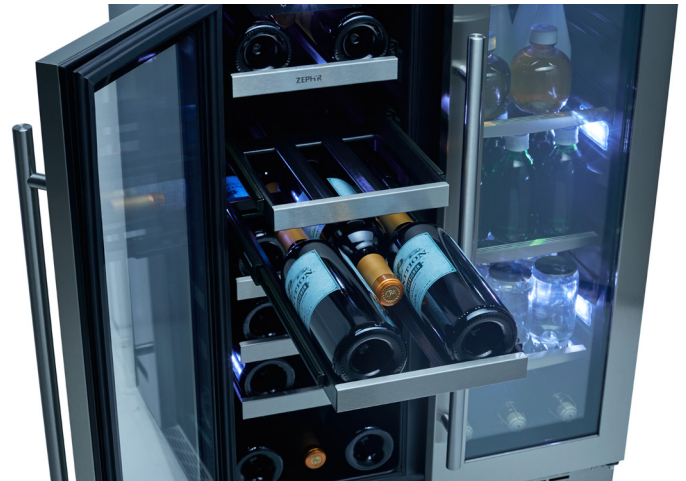
Full Extension Wood Racks