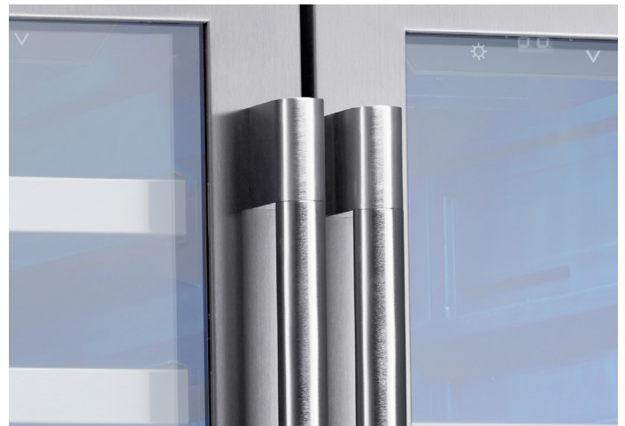
Optional Pro Handles