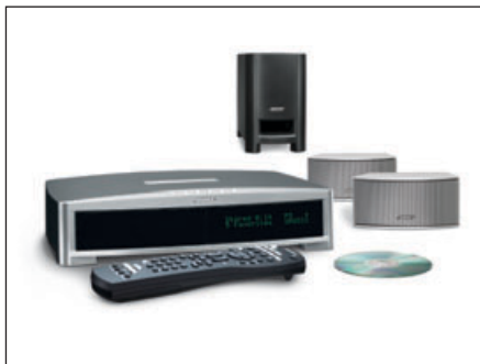
Silver: CD-ROM folder: photography CD-ROM file: 321GSX_sil_04.tif