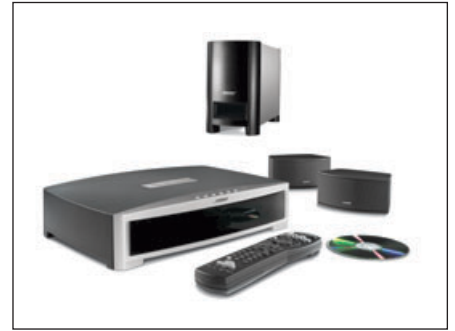
Graphite: CD-ROM folder: photography CD-ROM file: 321GSX_gry_03.tif