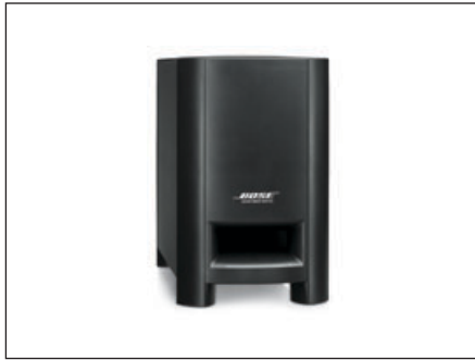
Acoustimass® module: CD-ROM folder: photography CD-ROM file: 321GSX_01.tif