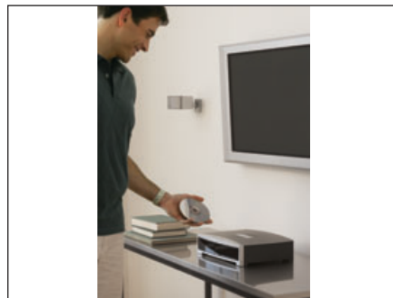
Silver: CD-ROM folder: photography CD-ROM file: 321GSX_ew_05.tif