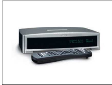
3·2·1 GSX media center: CD-ROM folder: photography CD-ROM file: 321GSX_02.tif