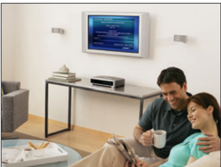
Silver: CD-ROM folder: photography CD-ROM file: 321GSX_ew_07.tif