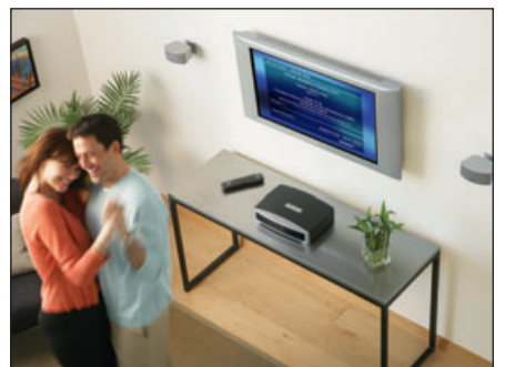
Silver: CD-ROM folder: photography CD-ROM file: 321GSX_ew_09.tif