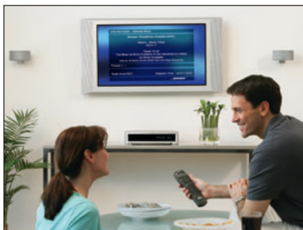
Silver: CD-ROM folder: photography CD-ROM file: 321GSX_ew_08.tif