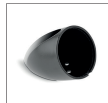
Tilted mounting frame: Easy to install