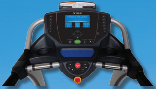
7" LCD Console