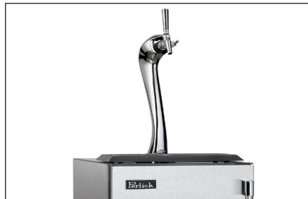
Adara Signature Beer Tower Detail