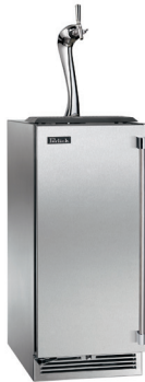
Solid Door Model