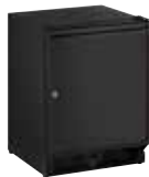
BLACK SOLID (LOCK)