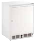
WHITE SOLID (LOCK)