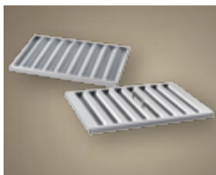
Hi-Flow™ baffle filters utilize a V-mesh & baffle design to increase airflow, decrease sound levels and provide excellent ventilation efficiency.