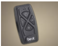
Optional ACR2 remote control lets the busy cook stay in control from anywhere in the kitchen.