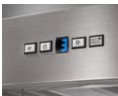
Three-speed, plus boost, electronic controls include 10-minute delay-off and filter clean reminder.