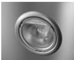
Four Halogen lamps brightly illuminate the cooktop.