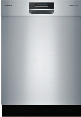
SHE8PT55UC Stainless Steel

Expandable wings on our flexible 3rd rack provide extra height to fit ramekins, measuring cups and extra-large utensils.