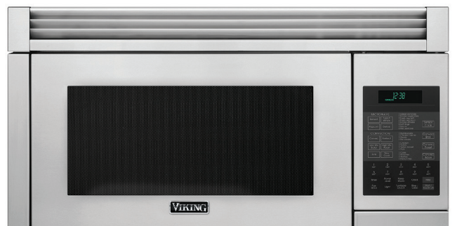
30" Wide Convection Microwave Hood