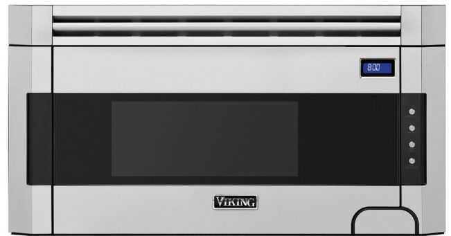
30" Wide Conventional Microwave Hood