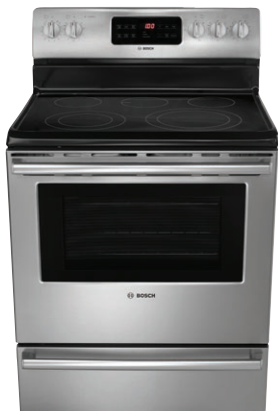
HES5L53U Stainless Steel

Ranges deliver power and functionality that help them perform as good as they look.