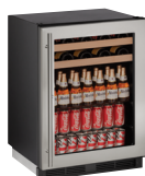
STAINLESS FRAME (LOCK)