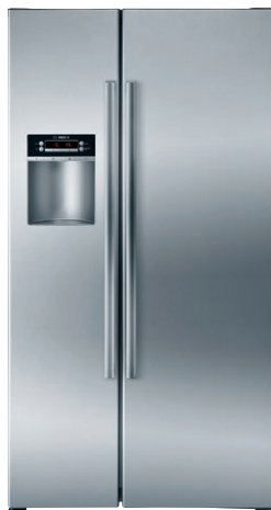
B22CS30SNS Stainless Steel

This counter-depth Side-by-Side refrigerator works efficiently to prevent the transfer of flavors and keep produce fresh longer.