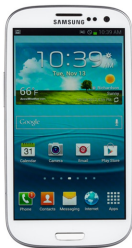
Samsung Galaxy S III

The name and location of the app might differ by device.