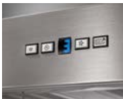
Three-speed, plus boost, electronic controls include 10-minute delay-off and filter clean reminder.