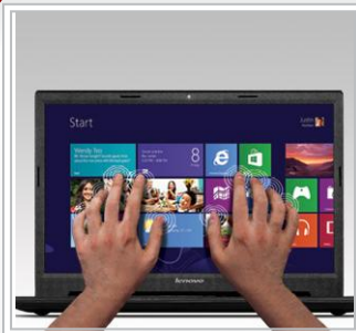
WINDOWS 8.1 OPTIMIZED FOR MULTITOUCH