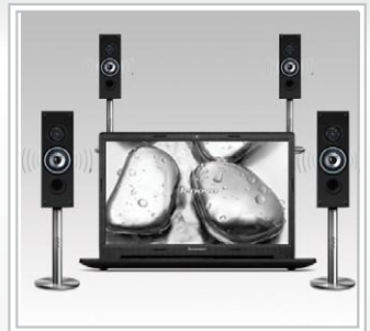
DOLBY® ADVANCED AUDIO™