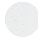
KI10203-03K Plumeria White