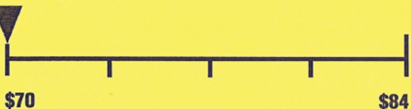
Cost Range of Similar Models