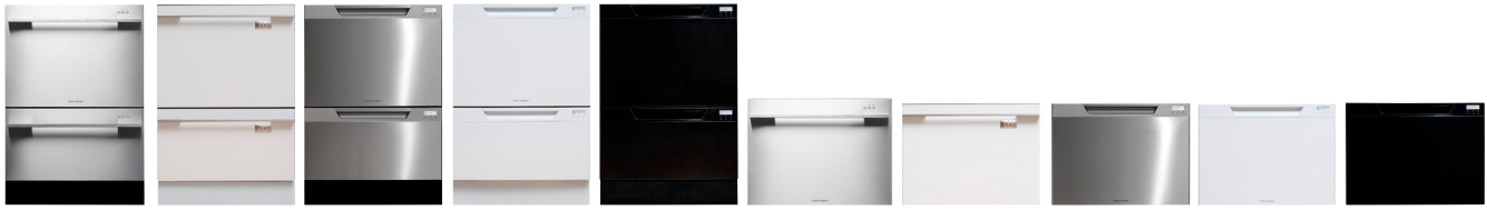
DD24DDFTX6 DD24DTI6 DD24DCTX6 DD24DCTW6 DD24DCTB6 DD24SDFTX6 DD24STI6 DD24SCTX6 DD24SCTW6 DD24SCTB6 DD24DTIH6 DD24DCTHX6 DD24SCTIH6 DD24SCTHX6