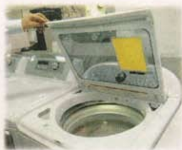
The Whirlpool Cabrio series washer has a see-through lid, as well as the capacity and low-water capabilities of many front-load models.

When it comes to ovens, ranges and cook tops, most people purchase a standard free-standing range with the ovens below the cook top, Klett said. Some, like the GE double oven/range, have replaced the old storage drawer under the large oven with a pull out,