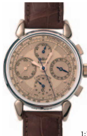
CH 7404 „Turtle“