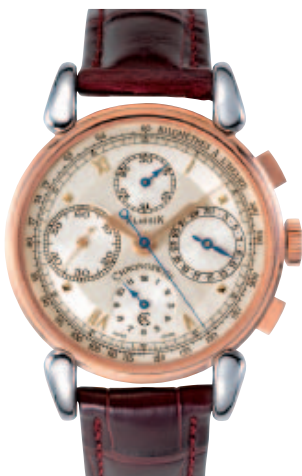
CH 7402 R