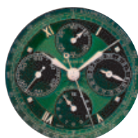
CH 7403 gr green