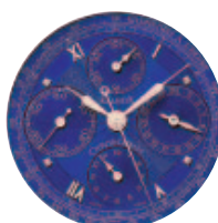
CH 7403 bl blue