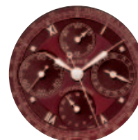
CH 7403 re red