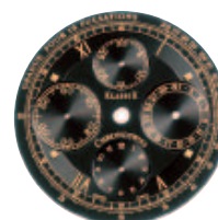
Pulsometer-Dial for all versions available