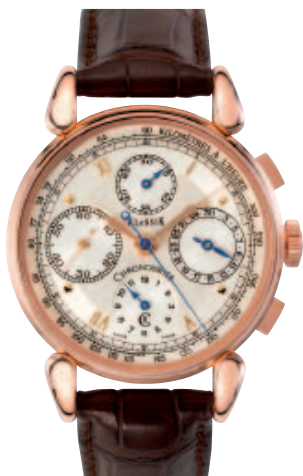
CH 7401 R