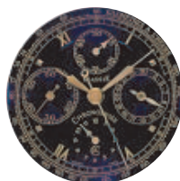
CH 7401 R bk CH 7402 R bk matte-black