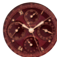
CH 7401 R re CH 7402 R re red