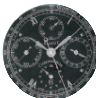
CH 7403 bk matte-black