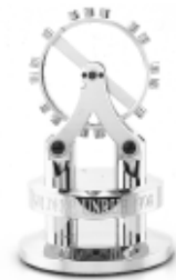
Golden Balance 1998 Uhrenmagazin