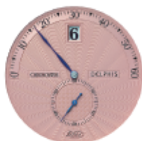
CH 1421 R co CH 1422 R co CH 1423 co copper