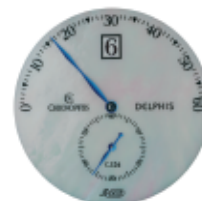
CH 1420 mp CH 1421 mp CH 1421 R mp CH 1422 mp CH 1422 R mp CH 1423 mp motherpearl