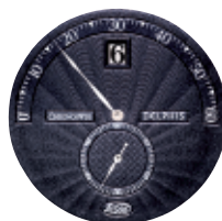
CH 1423 bk matte-black