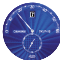
CH 1421 R bl CH 1423 bl blue