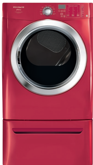
Optional SpaceWise™ Pedestal Drawer Shown