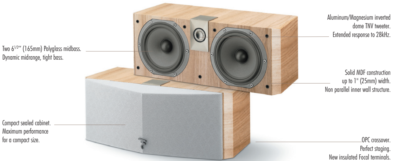
> Chorus CC 700 V, Light Walnut finish.