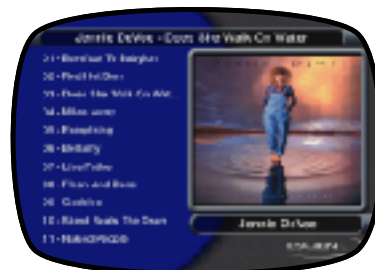
FireBall MP-100 Player