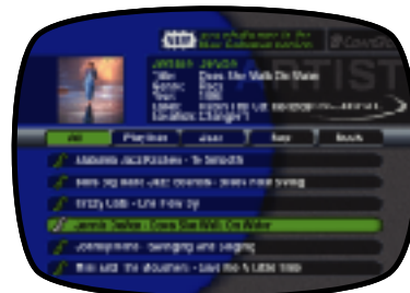
FireBall MP-100 Guide

The most intuitive interface on the planet is standard on FireBall.