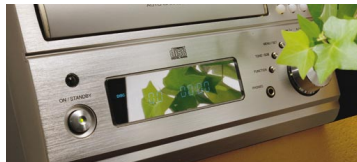
Half mirror display window