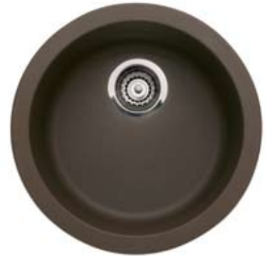
MODEL 515-803 Shown