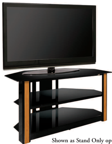
Shown as Stand Only option with Cherry trim