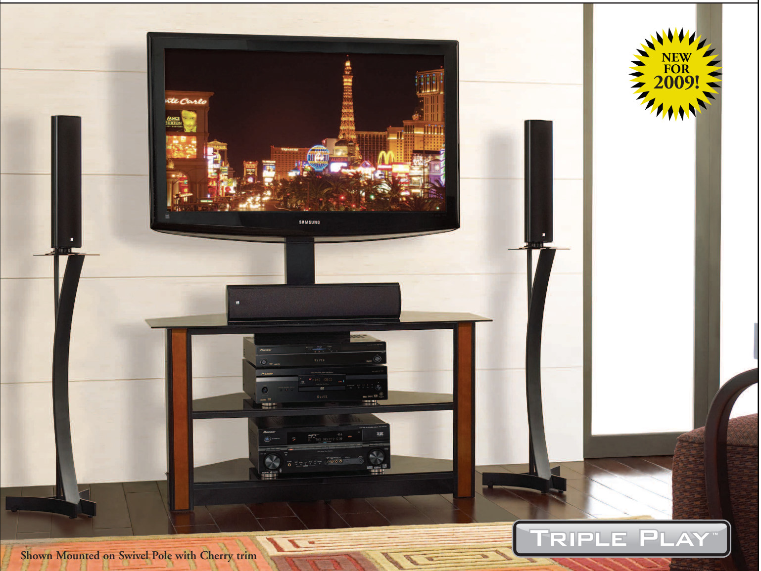
Shown Mounted on Swivel Pole with Cherry trim