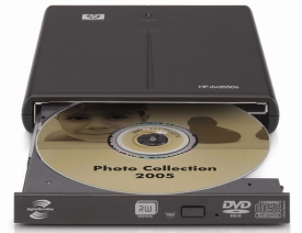
LightScribe technology lets you burn custom, silkscreen-quality text and images directly onto LightScribe-enabled CDs and DVDs.