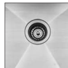
Basket Waste x1