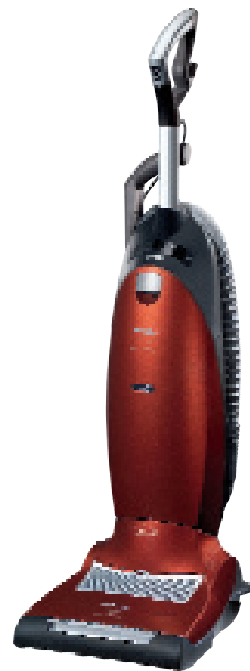
S 7580 Tango