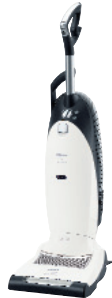
S 7280 Calypso