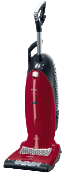
S 7280 Salsa