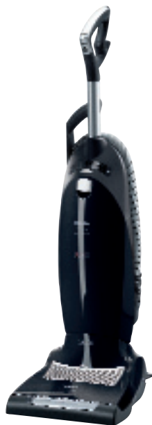
S 7580 Bolero