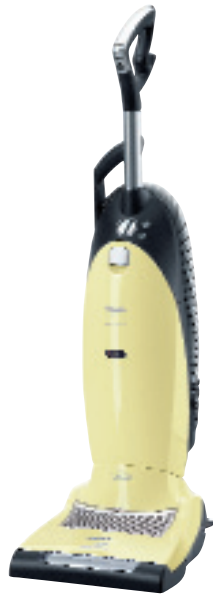
S 7280 Jazz