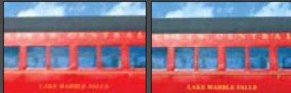
Conventional Auto Motion Plus 120Hz