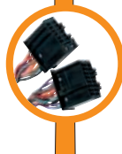
Media Gateway Harness Part #: PGHGM1