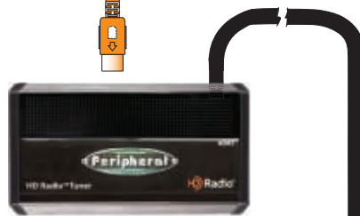
HD Radio™ Tuner (sold separately) Part #: HDRT