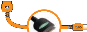
11Ft. iPod Cable