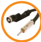
Antenna Adapter Sold Separately