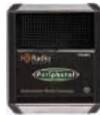
Media Gateway Part #: PXAMG