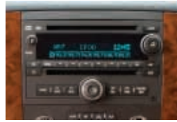
Factory Radio Not Included