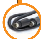
3Ft. HD Radio Cable