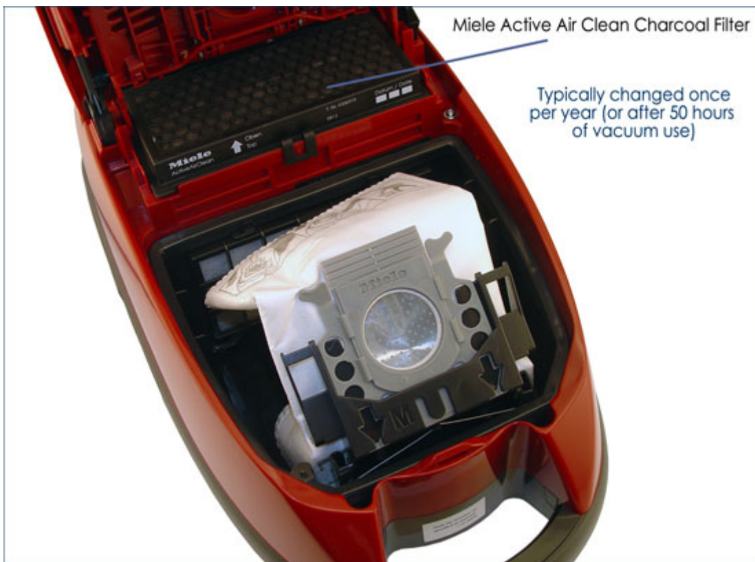
Miele Active Air Clean Charcoal Filter

Typically changed once per year (or after 50 hours of vacuum use)