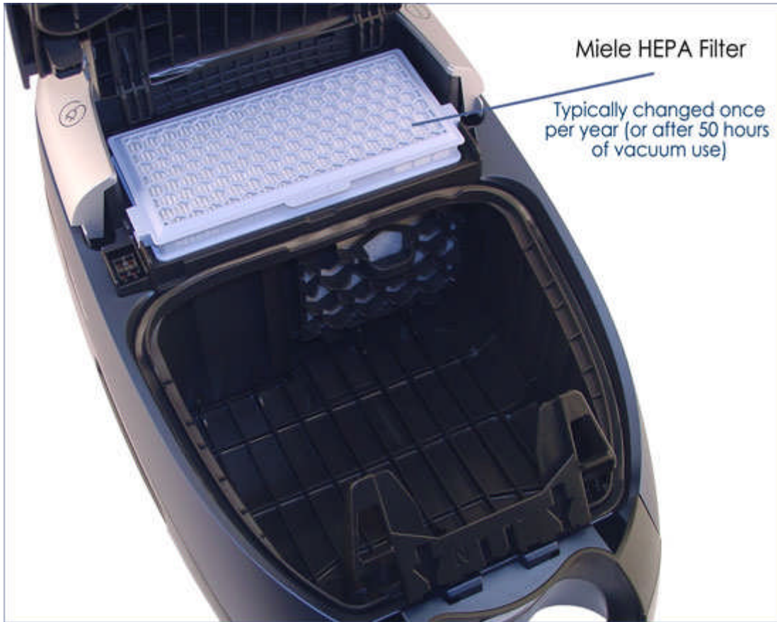
Miele HEPA Filter

Typically changed once per year (or after 50 hours of vacuum use)