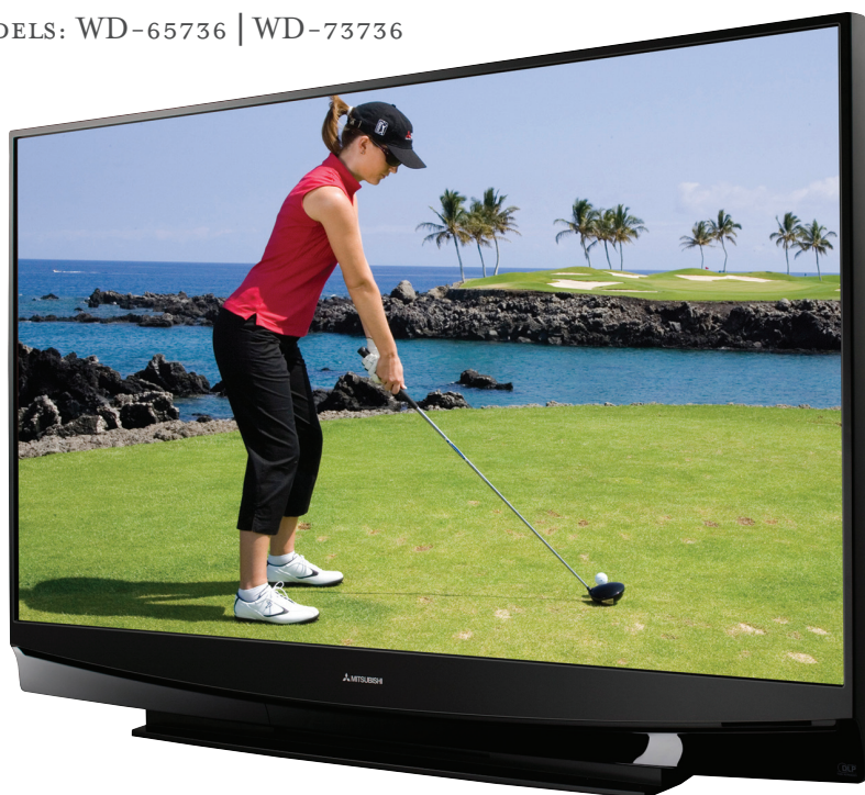
WD-65736 Shown Cabinet Color: Platinum Black Accent: High Gloss Black