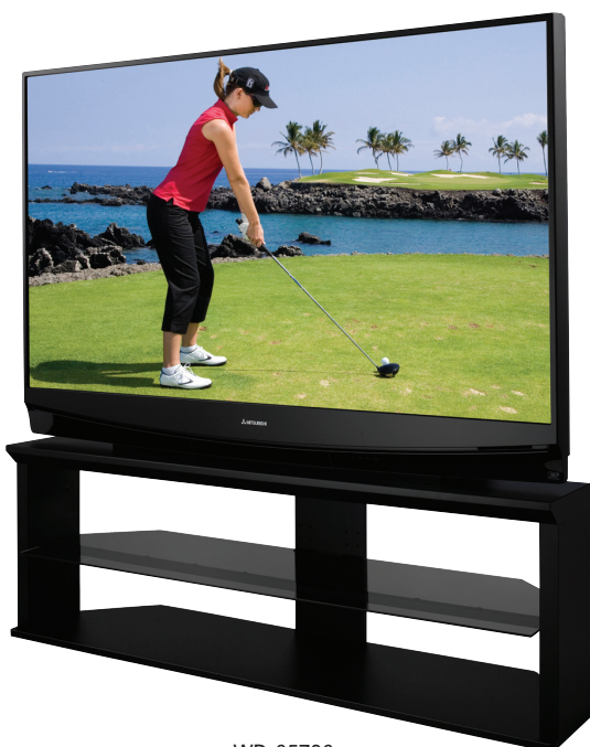
WD-65736 Shown on Optional Base (MB-S60/65 or MB-S73 for 73" model)