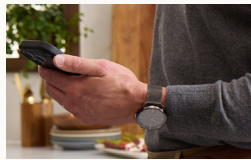
LG ThinQ® App