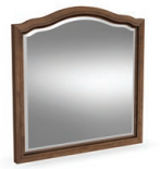
-880 MIRROR 38H 38W 2D