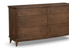
-860 DRESSER 37H 68W 20D