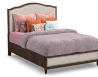
-90Q QUEEN UPHOLSTERED BED 56H 65W 88D