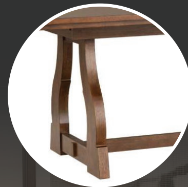
ORNATE, MUSIC INSPIRED DETAIL (DINING)