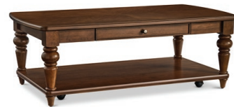
-0311 RECTANGULAR COFFEE TABLE WITH CASTERS 18H 52W 27D