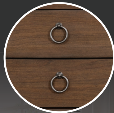
PEWTER FINISH RING PULLS & NAILHEAD TRIM