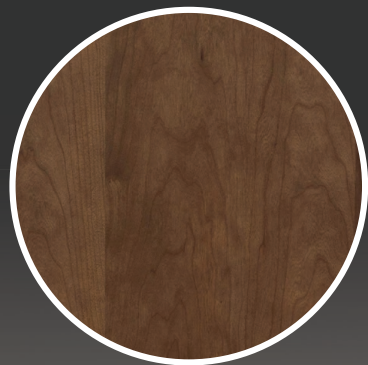
WHISKEY BROWN FINISH