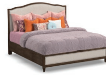
-90K KING UPHOLSTERED BED 56H 81W 88D