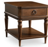
-01 END TABLE 23H 20W 26D