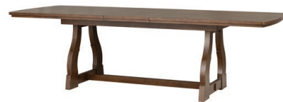
-831 RECTANGULAR DINING TABLE 30H 104W 40D