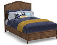
-91Q QUEEN PANEL BED 56H 65W 88D