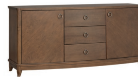
-06 CONSOLE 33H 68W 20D