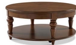
-0341 ROUND COFFEE TABLE WITH CASTERS 18H 40W 40D