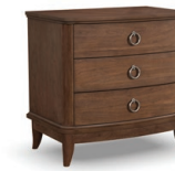
-863 NIGHTSTAND 27H 27W 18D