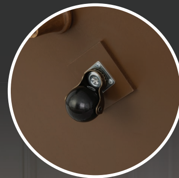
HIDDEN CASTERS (OCCASIONAL)