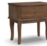
-864 OPEN NIGHTSTAND 27H 27W 18D