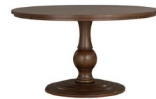
-834 ROUND DINING TABLE 30H 54W 54D