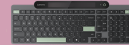
Lenovo Self-Charging Bluetooth Keyboard- French Canadian 058 4Y41R69498