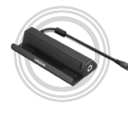
Lenovo Legion Go Dock