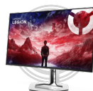
Lenovo Legion Pro 32UD-10