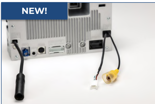
iDatalink® Maestro® pigtail connection.