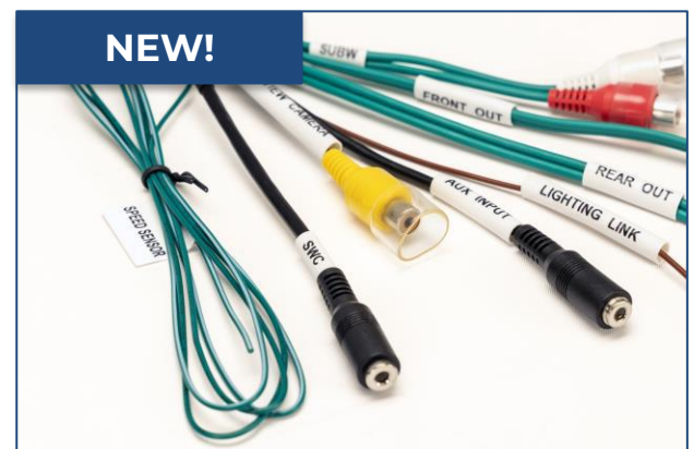
New SWC Adapter (3.5MM Mini Jack).