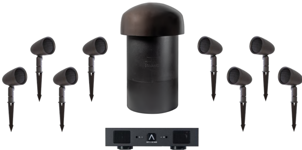
SGS System SKU 93570