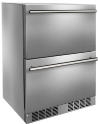
MRDR224-SS71A Stainless Steel Solid