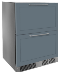
MRDR224-IS71A Panel Ready Solid