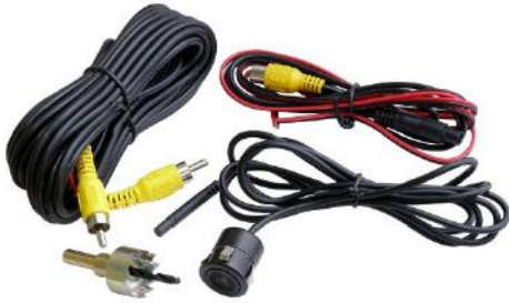
Camera and wiring