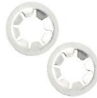
2 Push nuts