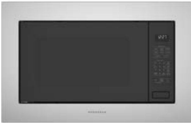
Shown with stainless steel built-in trim kit that is sold separately