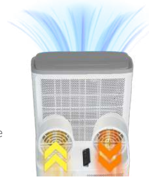
OUTSIDE AIR HEAT REMOVED FROM ROOM

DUAL-HOSE DESIGN: Dedicated intake & exhaust hoses balance air circulation, expelling hot air outdoors, and keeping cooled, conditioned air inside resulting in up to 40% faster cooling.