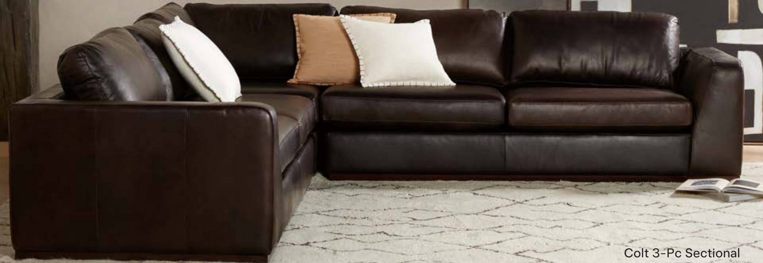
Colt 3-Pc Sectional