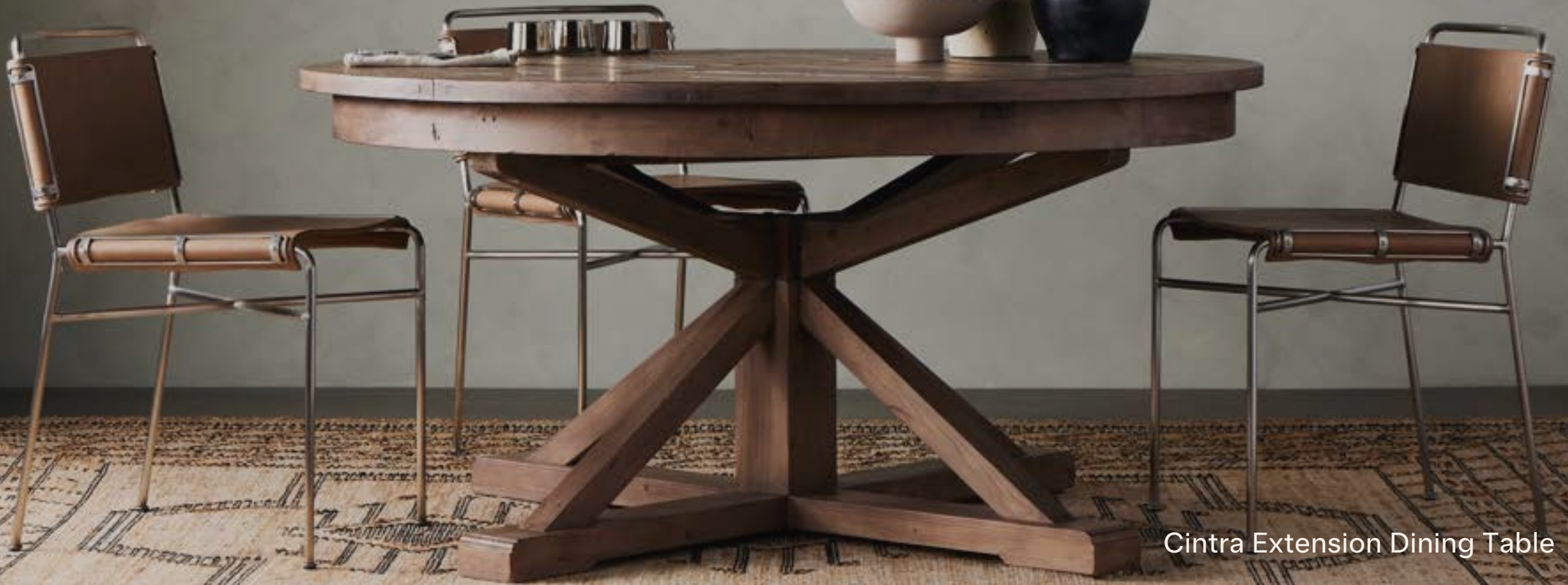
Cintra Extension Dining Table