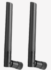
2 x External Antenna