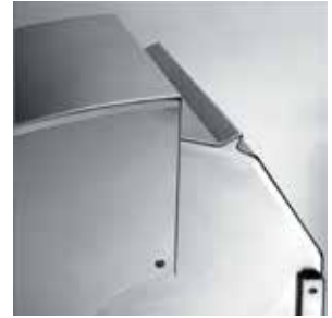
HEAT STABILIZING DESIGN