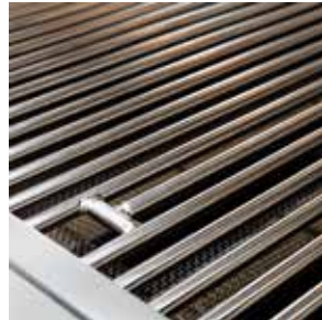
EXPANSIVE GRILLING SURFACE