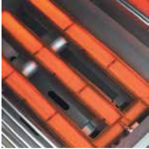
TRIDENT™ INFRARED BURNER

Our unrelenting attention to detail and our passion for innovation have fostered the stunning features that define the Lynx Professional Series. These features begin with meticulous hand-crafted excellence, and they culminate in powerful capabilities that give you precision control.