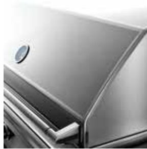
SEAMLESS WELDED CONSTRUCTION