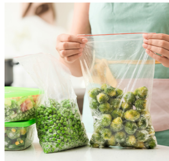
Steamer Bag Preset Easily Steams a Bag of Frozen Veggies up to 17oz