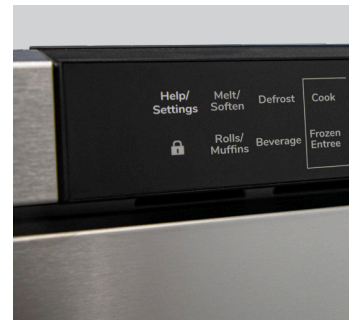
Enable Control Lock to Prevent Accidental Operation