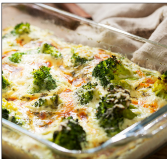
Cooking Space Large Enough for a 4-qt Casserole Dish or a 20 oz. Beverage

The Sharp SMD2440JS Microwave Drawer™ Oven with Sensor Cook features our Easy Touch Automatic Drawer system to gently open the drawer with the touch of a button. Use the same button or give the drawer a small nudge, and it closes smoothly. The even, gliding action and solid construction help prevent liquids from spilling during opening and closing. The SMD2440JS can be wiped with a damp cloth inside and out for quick and easy cleanup. Audible signals can be turned on or off, and the control panel can be locked down to prevent accidental operation by small children and while cleaning. Now that is Simply Better Living.