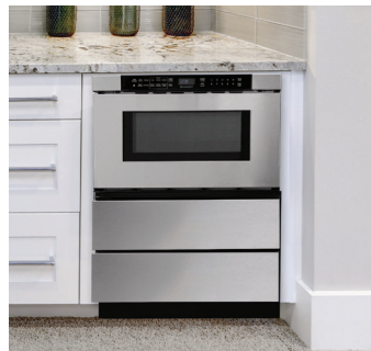
Optional Pedestal Accessory (SKMD24U0ES) Slides Under the Counter for Convenient Installation