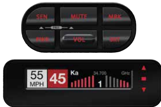
Redline Ci 360c